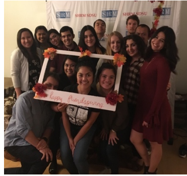
SHRMsgiving with Career Peers