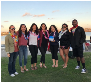
Business Org. Bonfire